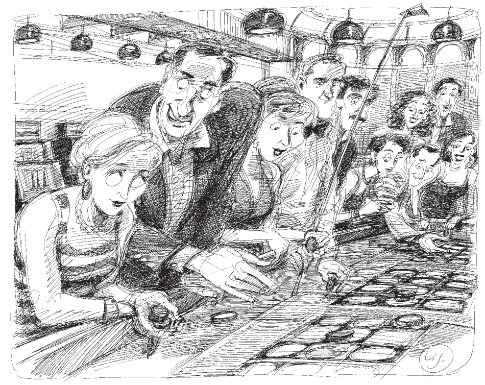
"Wanna come to my room and watch a video of D'Alessandro making $100 million?"

As we've discussed in previous articles, Hancock deceived its policyholders in many ways during the demutualization process (which was completed in