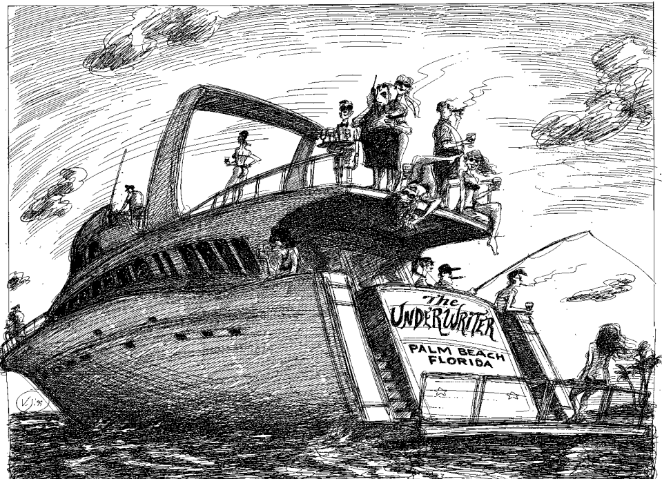
"Damn it, Johnson! If you don't cut claims, we'll have to cut expenses."